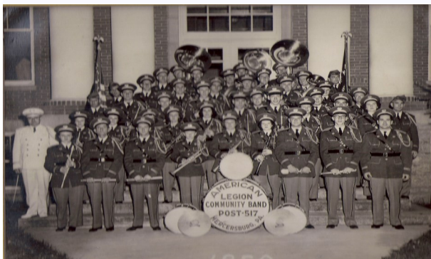
American Legion Community Band Post 517