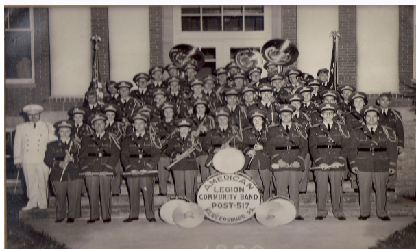
American Legion Community Band Post 517