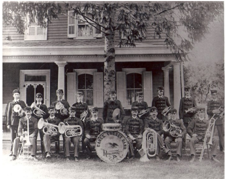
(Continued on page 3)

Organized first as the Eagle Cornet Band, the MACB's purpose is to serve the various ceremonial needs of the greater Mercersburg Community (Adams, Franklin, and Fulton Counties). The band is comprised of volunteers who